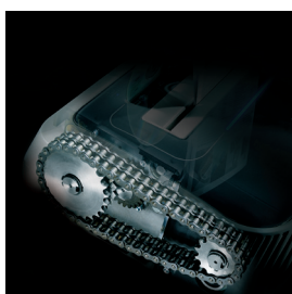
CHAIN heavy duty chain drive system and metal gears