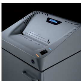
LED INDICATORS Easy to operate ON OFF Reverse switch, with LED signal for bag full or open door