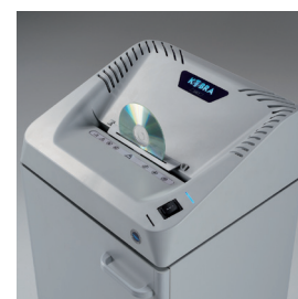
AUTO START & CD SHREDDING Automatic Start/Stop through electronic eyes. Integrated flap for CDs, DVDs, Floppy Disks and Credit Cards shredding