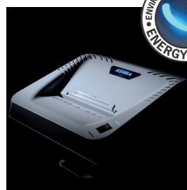
ENERGY SMART ® management system with illuminated indicators for power saving in stand-by mode